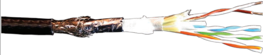
PCCAT5EP CAT5e SF/UTP Ethernet Patch Cable