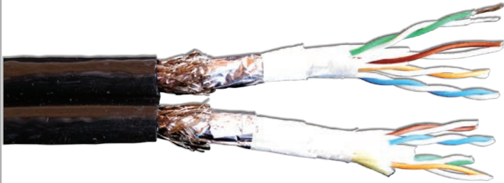
PCCAT5EP2X Dual CAT5e SF/UTP Figure Eight Cable