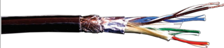
PCCAT5EP26AWG CAT5e 26AWG SF/UTP Ethernet Cable